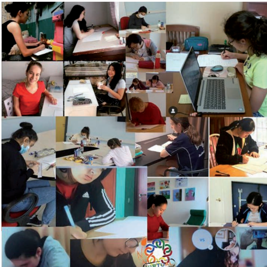
Students sitting the paper