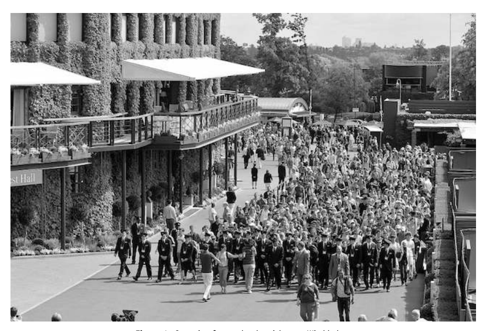
Figure 1 Queueing for on-the-day tickets at Wimbledon.

counter of a supermarket, an elevator, a traffic light intersection, a machine that produces parts, a computer processor processing jobs, or a communication channel with a buffer for packets which still need to be transmitted. In some situations customers are initially willing to wait, but might become impatient at some