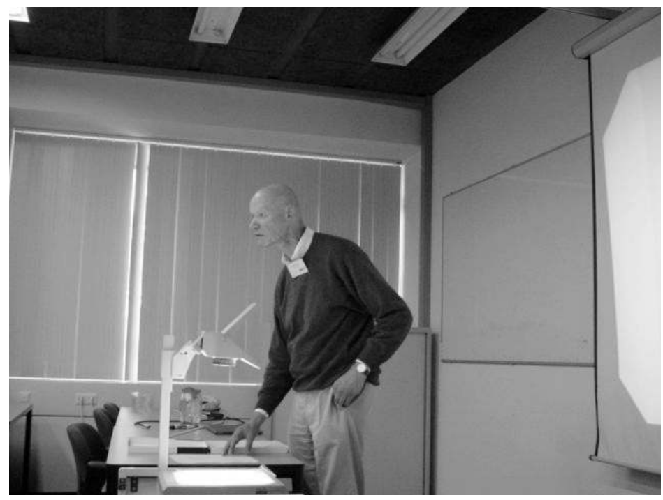
Lecturing at Lorentz Center, Leiden, 2004

For the second question Thomas introduced the notion of \Sigma -completeness. A Banach space E is \Sigma -complete if, for every sequence (x_n) with the property that \sum_{n=1}^{\infty} |\langle x_n, x' \rangle| < \infty for all x' \in E' , there exists x \in E such that \sum_{n=1}^{\infty} \langle x_n, x' \rangle = \langle x, x' \rangle for all x' \in E' . Then Thomas proved: If the Banach space E is \Sigma -complete then a scalar-integrable function f is integrable, and the weak integral of f agrees with the integral of f. The thesis, which contains a large number of other results, has