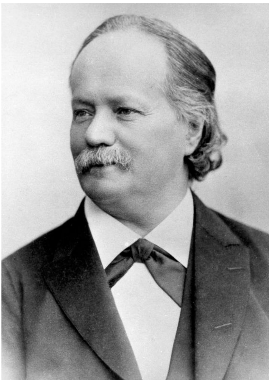
Lazarus I. Fuchs (1833–1902)

was surely that his simple geometric transformation converts the pictures of a net inside a disc made of triangles with circular-arc sides into a net of triangles inside a disc but with straight sides — and this is the non-Euclidean disc of Beltrami. It follows that the original net of triangles can be regarded as made up of congruent copies of the same triangle, where congruence is to be taken with its non-Euclidean meaning. Now instead of analytic continuation as the basic mechanism, Poincaré had isometries to work with. We do not know how Poincaré first heard of non-Euclidean geometry, but Hoüel had translated the original papers by Bolyai