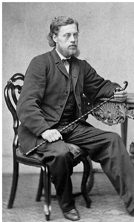
Sophus Lie (1842–1899)

When it is valid Lie said the transformations formed a group (the modern term is a group germ). Lie did not demand inverses, nor indeed did he specify that there be an identity transformation of this form.