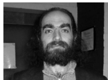
Main characters, from left to right, first row: the geometer Gregorio Ricci-Curbastro (1853–1925), who created absolute differential calculus that became the foundation of tensor analysis; William Thurston (1946), who formulated the geometrization conjecture; Henri Poincaré (1854–1912), who stated the celebrated conjecture; second row: Shiing-Shen Chern (1911–2004), who linked curvature invariants to characteristic classes; Richard Hamilton (1943), the inventor of the Ricci flow; Fields medallist Stephen Smale (1930), who solved the Poincaré conjecture for all dimensions greater than 4; third row: Fields medallist Shing-Tung Yau, founder of the geometry behind string theory; Gang Tian, who worked out the Perelman proof in detail together with John Morgan; Grigori Perelman (1966) who proved Thurston's geometrization conjecture

came as a surprise. By the time he was fourteen, he was the star performer of a local math club. In 1982, the year that Shing-Tung Yau won a Fields Medal, Perelman earned a perfect score and the gold medal at the International Mathematical Olympiad, in Budapest. He was friendly with his teammates but not close — "I had no close friends," he said. He was one of two or three Jews in his grade, and he had a passion for opera, which also set him apart from his peers. His mother, a math teacher at a technical college, played the violin and began taking him to the opera when he was six. By the time Perelman was fifteen, he was spending his pocket money on records. He was thrilled to own a recording of a famous 1946 performance of "La Traviata," featuring Licia Albanese as Violetta. "Her voice was very good," he said.