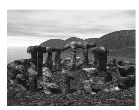
Pi-henge by Lisa Hakesley

sense, numbers that existed were numbers that could be drawn with just an unmarked ruler and compass. The rules allowed for starting with a fixed length of 1 and seeing what could be constructed with straight edge and compass alone. (Our current notion is much more based on counting.) The question of whether \pi is a constructible magnitude had been explicitly raised as a question by the sixth century BC and the time of the Pythagoreans. Unfortunately \pi is not constructible, though a proof of this would not be available for several thousand years. In this context there isn't a more basic question than "is \pi a number?" Of course, our more modern notion of number embraces the Greek notion of constructible and doesn't depend on construction. The existence of \pi as a number given by an infinite (albeit unknown) decimal expansion poses little problem.