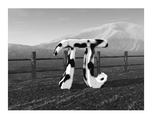
Cow Pi by Lisa Hakesley

256 NAW 5/1 nr. 3 september 2000 The amazing number \pi Peter Borwein