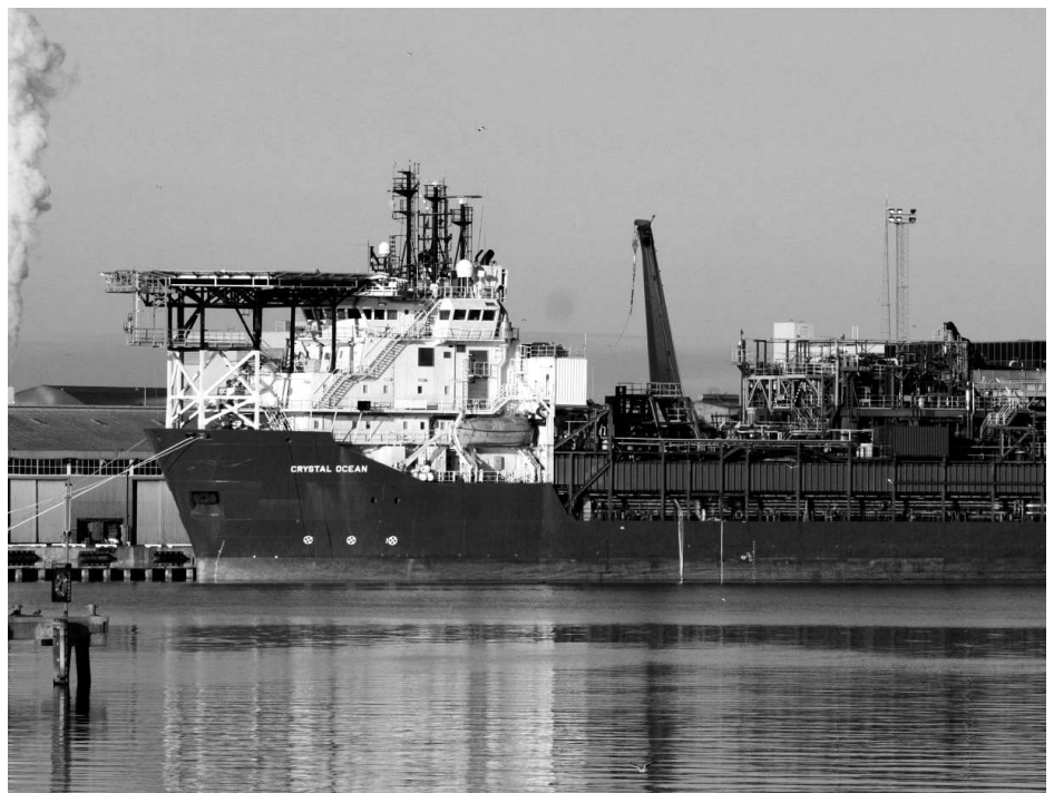
Example of an floating production, storage and offloading unit